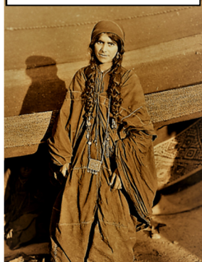
TAMAR, the widow

Tamar is just the widow, trying to follow the natural laws that she understood. Her 1 st husband was evil, he dies. Her 2 nd just takes what he wants; he dies. The 3 rd , never shows up.