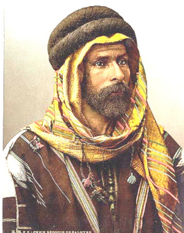
BOAZ marries RUTH

Boaz is the 6 th grandson of Perez. Boaz marries Ruth Boaz is King David's Grandpa